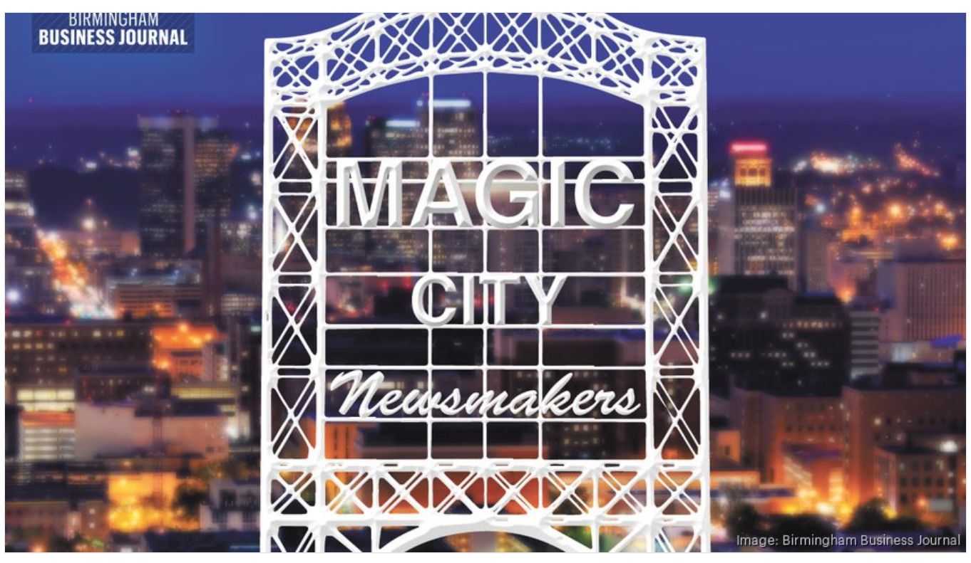
Magic City Newsmakers includes notable awards, anniversaries, news and other tidbits about Birmingham businesses and nonprofits. BIRMINGHAM BUSINESS JOURNAL